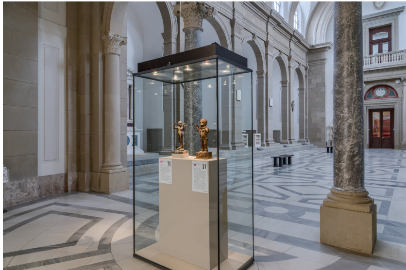
Fig. 3: Putto with a Tambourine , by fifteenth-century Italian artist Donatello, sits beside Statue of the Goddess Irhevbu or Princess Edeleyo , made in the Kingdom of Benin sometime in the seventeenth or eighteenth century. Staatliche Museen zu Berlin–Preußischer Kulturbesitz. Skulpturensammlung und Museum für Byzantinische Kunst.

institution proposed itself the main focus of the exhibition; second, it is yet another rehearsal of the old modern science progress story: we used to think we knew the truth, but then the true truth emerged, and we realized we were mistaken back then; and third the display papers over the assumption that both objects remain the cultural property of the German State, despite implicit recognition of the dubious morality of the exchanges that enabled passage of the Benin goddess/princess from Benin City to Berlin. I come back to this display – the art objects deserve better than this.