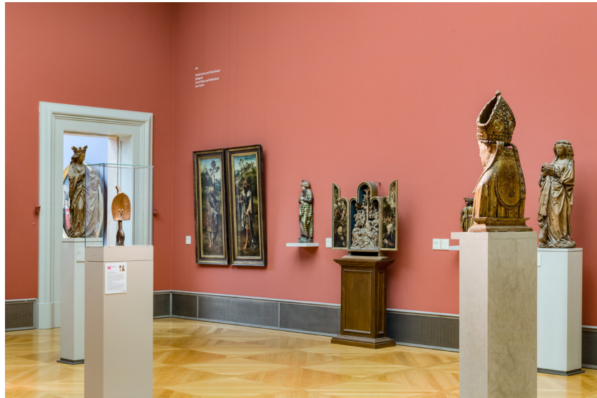
Fig. 5: The diminutive Bwiti Figure lights up the room. Staatliche Museen zu Berlin–Preußischer Kulturbesitz. Skulpturensammlung und Museum für Byzantinische Kunst.

My experiment in knowing-looking over, I retreat to the bookshop and a cup of tea. As I browse through the exhibition catalogue, I feel the inevitable sadness of goodbyes. These objects, many no doubt stolen from the African places in which they first came to life, or at very least exchanged in conditions where power was distributed very unevenly, will not be in this museum space next time I visit – coming to life, calling out or not, to the objects that surround them. I cheer myself with the thought that at least some of the art works might in the next few years, make their way back to their places of origin.