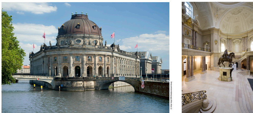
Fig. 1 and 2: The Bode Museum enacts modernity's cosmic goals. Staatliche Museen zu Berlin–Preußischer Kulturbesitz. Skulpturensammlung und Museum für Byzantinische Kunst.

1995, while celebrating the 150-year anniversary of Bode's birth, such ambitions, along with an unwillingness to take on a relativist epistemic ethos more suited to a postcolonial world were made obvious. »The cosmic goals [of the institution for which] only an ensemble of universally accepted ›master- pieces‹ from all over the [...] world was uniquely adequate, [were] the ambitions of Bode's employer« (Eisler 1996: 32), the implication being, that such cosmic goals were still valid in 1990s. This institutional ethos in its period displays proposes its art objects as expressions of the many diverse cosmologies that historically have animated the past polities of Europe. Yet, these cosmologies can only ever be mere steps on the way to a triumphant European modernity, with its powerful but backroom, instrumentalist spacetime cosmology, which the Bode Museum as a whole represents.