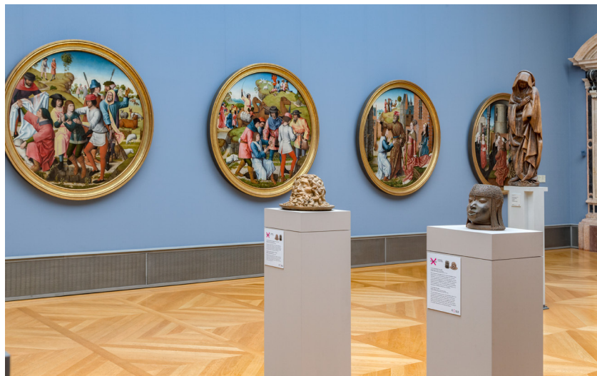
Fig. 4: The stories of John the Baptist and the Oba of Benin dominate. Staatliche Museen zu Berlin-Preußischer Kulturbesitz. Skulpturensammlung und Museum für Byzantinische Kunst.

On my fourth and final visit to the exhibition in August 2019, I find the Beyond Compare exhibition displays are being dismantled. Fortunately, the displays on the second floor remain untouched, so the experiment in experiencing I have been planning is still feasible. I am headed for gallery 209, a display space that I know well, having lingered in it on previous visits. There, in the center of the room is a pair of objects that feature in the exhibition's advertising. The Bwiti figure made in the nineteenth century within the Bwiti community of the Kota or Kélé people in the Republic of Congo or in Gabon, one of that pair, seems to be the darling of the exhibition. The companion piece in the display, a reliquary bust of a bishop made in Brussels in 1520, seems to be merely a foil. On previous visits I had observed that visitors often lingered in the room of this display.