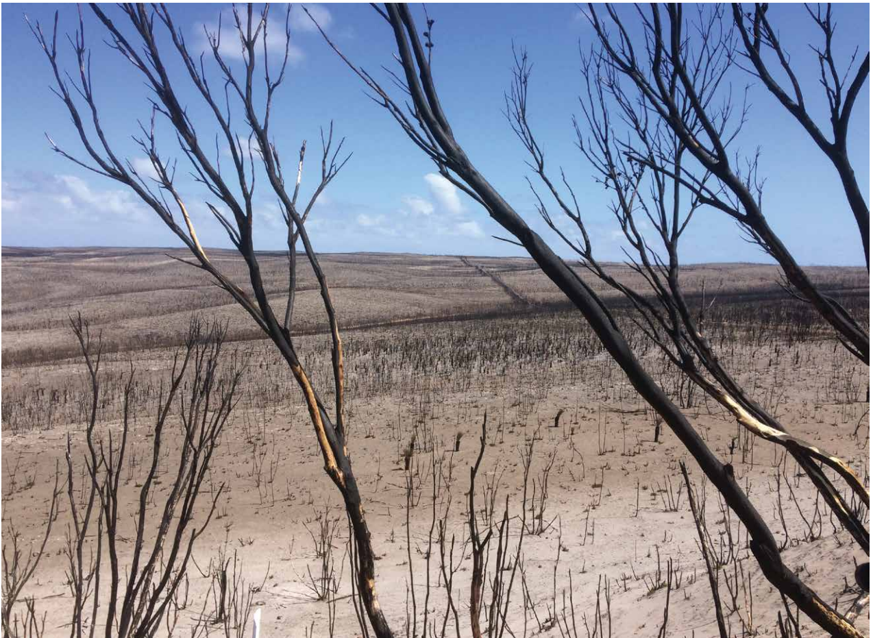
Figure 1. The devastated landscape following the 2020 wildfire on Kangaroo Island.