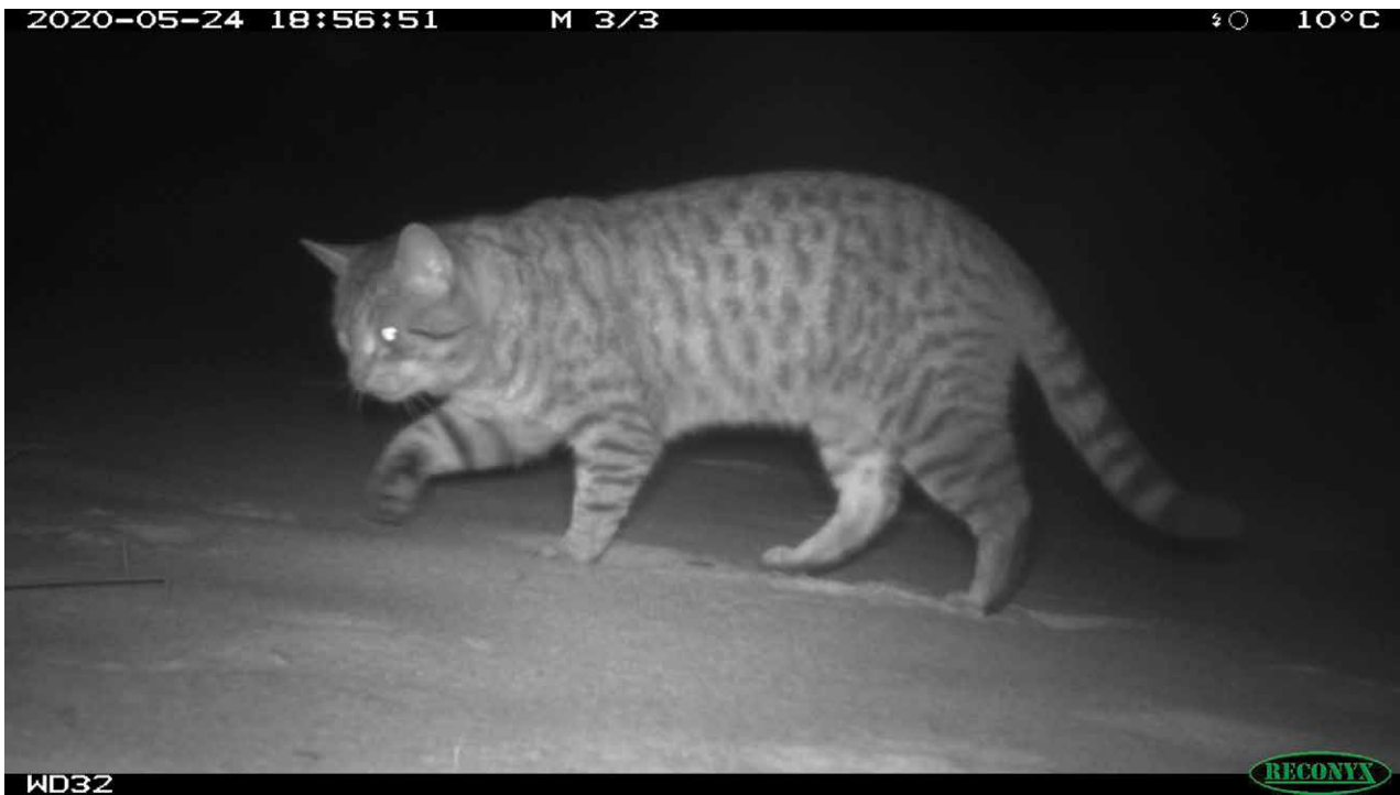
Figure 3. An example of a camera trap image of a feral cat where pelage patterns, particularly areas of the tail, fore and hind leg can be used for individual identification.