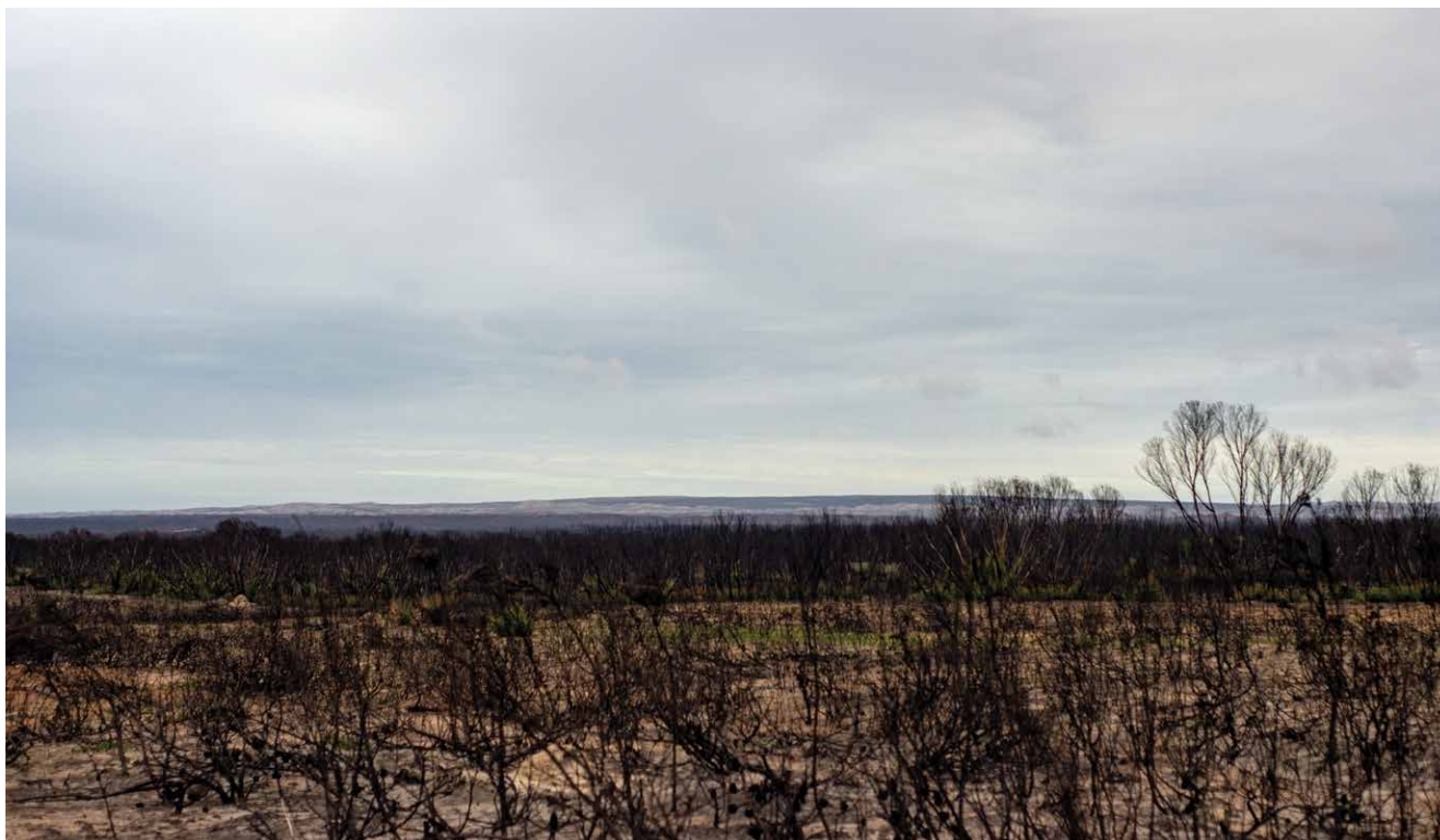
We recommend ecological studies to better understand how cats use landscapes largely burnt by severe fires.

Study methods were approved by Charles Darwin University's Animal Ethics Committee (Permit Number A20021), and the South Australian Department for Environment, Water and Natural Resources (Scientific Research Permit Y26970-1).