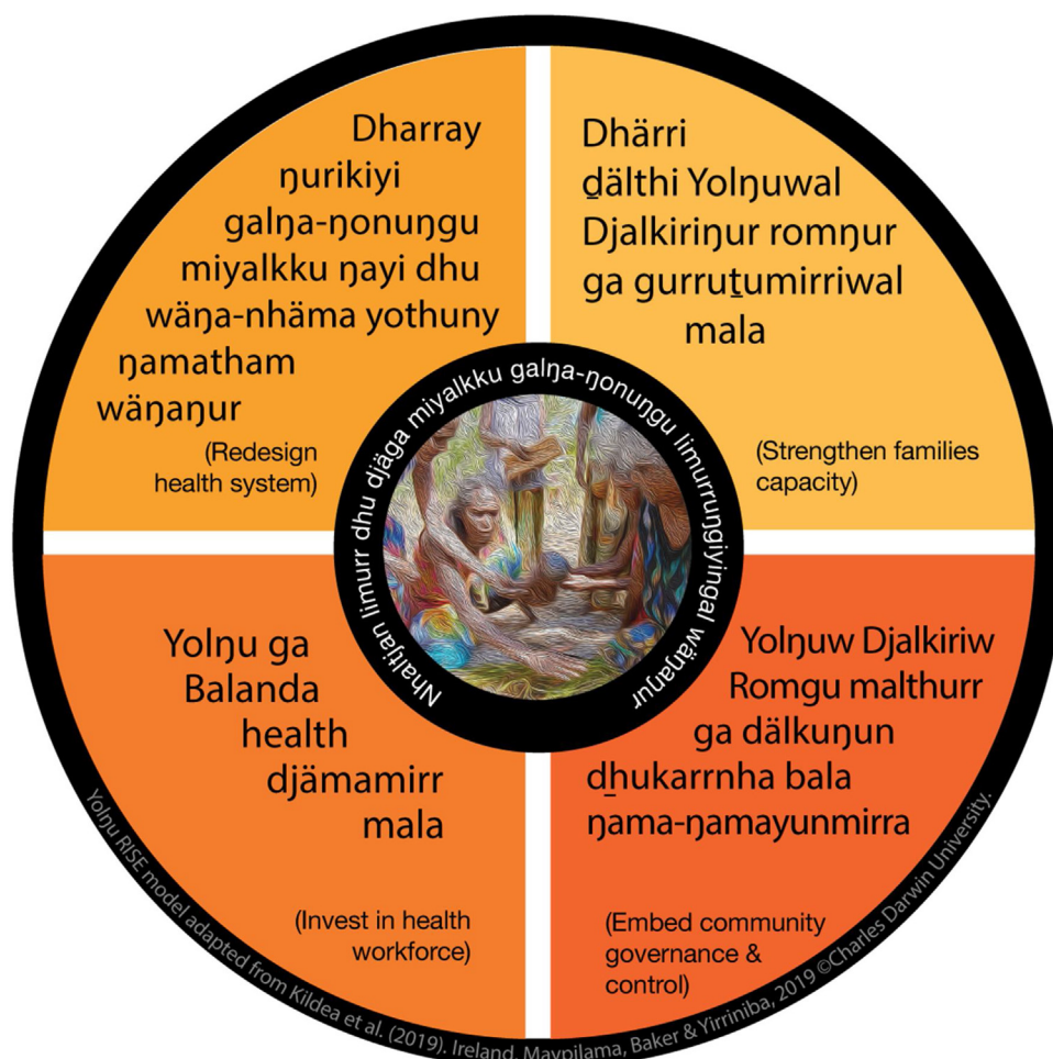
Fig. 1. Caring for Mum on Country-Yolŋu RISE Framework adapted from Kildea et al. (2019).

Shared understandings of the RISE Framework facilitated the development of a localised framework of ‘Caring for Mum on Country’ (see Fig. 1). There were several iterations and many changes to the spelling as written protocols for Djämbarrpuyŋu are in their infancy. Yolŋu reported the co-interpreting discussions were empowering as they reinforced the value of their cultural practices and the importance of maintaining and continuing them; for non-Yolŋu researchers, it enhanced their capacity to understand