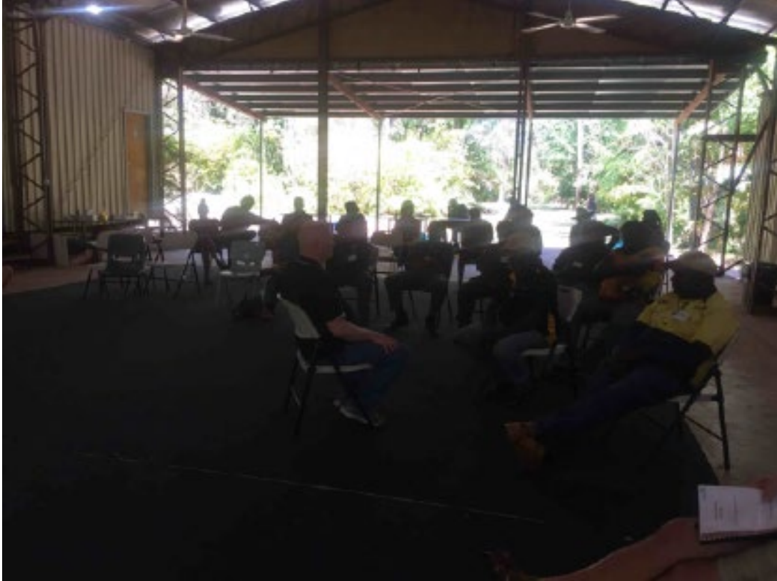
Participants at the leadership workshop, held near Darwin in August 2019.