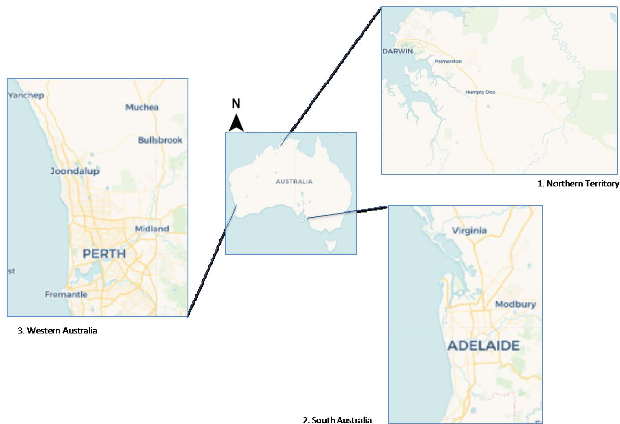
Figure 2: Map of research areas.

Communities of Vietnamese farmers live and farm in some states and territories in Australia, especially in regional areas of the Northern Territory (NT), South Australia (SA), and Western Australia (WA) (Figure 2), where this research was undertaken. The majority of interviewed farmers across all jurisdictions immigrated to Australia after 1975. Of the three selected jurisdictions, Vietnamese farmers in the Northern Territory had recently been affected by Green Cucumber Mottle Mosaic Virus when the research was conducted in 2015.