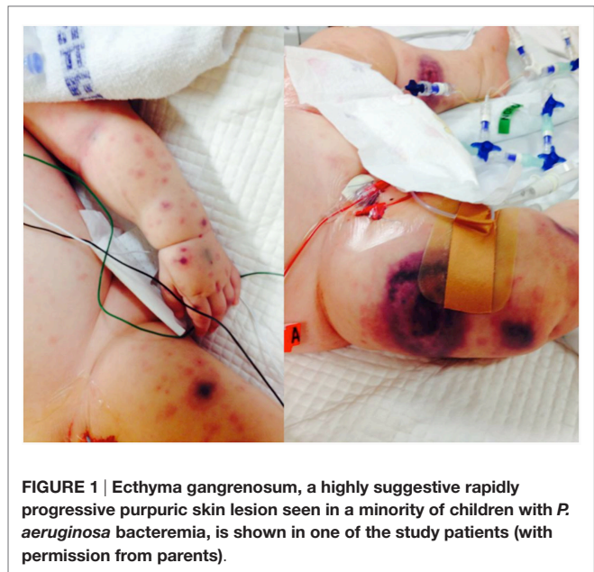
FIGURE 1 | Ecthyma gangrenosum, a highly suggestive rapidly progressive purpuric skin lesion seen in a minority of children with P. aeruginosa bacteremia, is shown in one of the study patients (with permission from parents).

F, female; M, male; mo, months old; CRP, C-reactive protein; WCC, white cell count ( \times 10^9/l ).