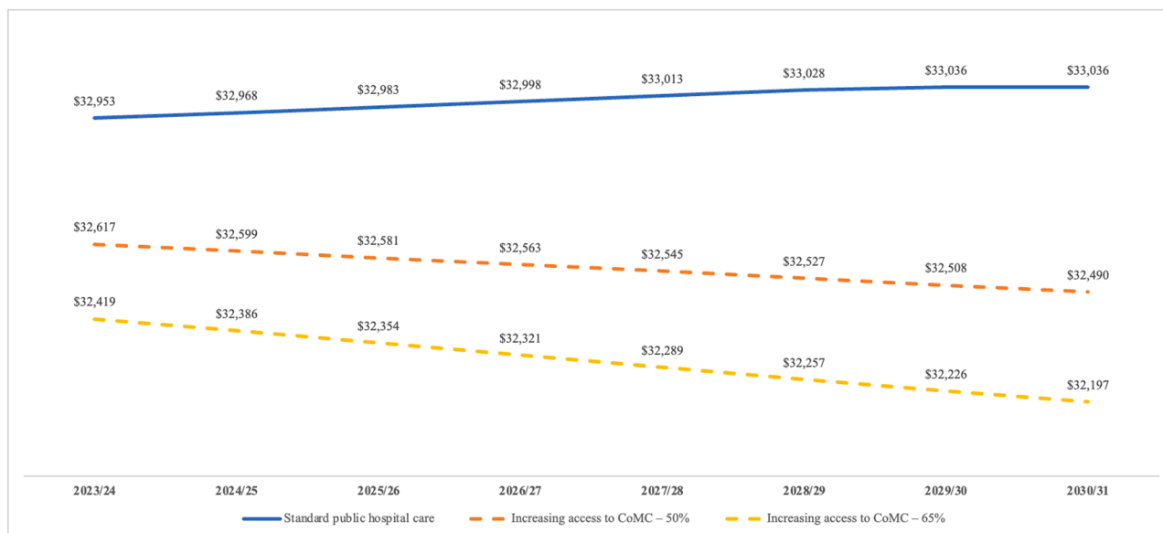
Fig. 2. Mean total costs per pregnancy to public hospital funders if increase access to continuity of midwifery carer – all projected women giving birth in public hospitals, Queensland, Australia, 2023/24 – 2030/31.

Abbreviation: CoMC = Continuity of midwifery carer. $ = AUD 2021/22.